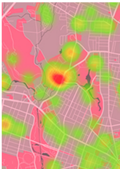
FIG. 2. New Haven: heat map showing patterns of the love emotion on education related topics

Another example, always in New Haven, shown in Figure 2, uses the same technique and timeframes to show expressions of love 6 for the theme of education, as inferred by the cultural events stimulus by taking into account all of the captured contents mentioning schools, universities, education projects, professors, teachers and a number of their variants, as well as the conversations which spawned from them.