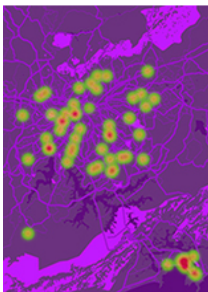
FIG. 3. Sao Paulo: the emotion of anxiety for the water crisis, as expressed on social networks, from the beginning of April to the end of November 2014, showing 387,173 user generated contents

To confront with the revised research question, some more evidence is required, both in qualitative and quantitative terms. For this we will concentrate, as a meaningful example, on Sao Paulo's current and upcoming water crisis. 11 In the city, an extended dry season and the ever-increasing demand of water have been leading, during the second semester of 2014, to a draught. At the apex of the water crisis the political elections were taking place, in October, finding the political forces unwilling to confront with this issue, to avoid loosing consensus. On top of that, the private water companies – using the crisis at their political advantage to make claims and releasing limited and contradictory information –, the pollution of the rivers, the needs of the industry and the marked inequalities which are present in the area all contributed to a chain reaction, whose effect was the sudden emergence of the crisis across entire areas of the federal state of Sao Paulo which were practically left with no water. We were able to observe the city of Sao Paulo during most of the crisis. A visualization of the feeling of anxiety 12 for the water crisis, as expressed on social networks, can be seen in Figure 3.